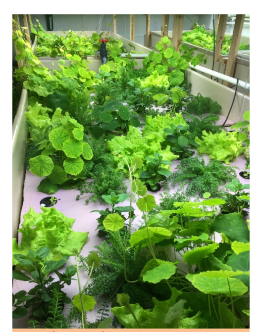
FIMTA floating raft grow-beds showing yarrow, mint, lettuce, chamomile and nasturtium after six weeks of growth at 13-15 °C in effluent collected at a commercial salmon hatchery.

IMTA is a flexible concept on which many variations can be developed and should not be viewed as confined to openwater, marine systems. For instance, Atlantic salmon reared for commercial use spend the early part of their life cycle in freshwater, often in land-based, closed-containment hatcheries before being transferred to open-seawater sites.