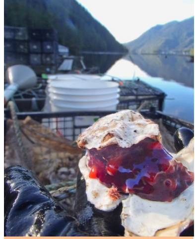
California sea cucumber, Parastichopus californicus, hiding in a Pacific oyster, Crassostrea gigas, shell at Effingham Oyster Ltd. farm in Barkley Sound, on the west coast of Vancouver Island.

CIMTAN member quote of the month: "Sea cucumbers are fascinating animals to study with their pentaradial symmetry, locomotion via their water vascular system and hundreds of tiny tube feet, an uncentralized nervous system, an ability to eviscerate organs, and their soft bodies which can quite dramatically change shape and size. Although, it's these interesting characteristics that make sea cucumbers difficult to contain in a traditional aquaculture setting. The solution to this containment issue requires thinking outside the box and within the ecosystem-based management approach to IMTA" ( CIMTAN MSc candidate Angela Fortune ).